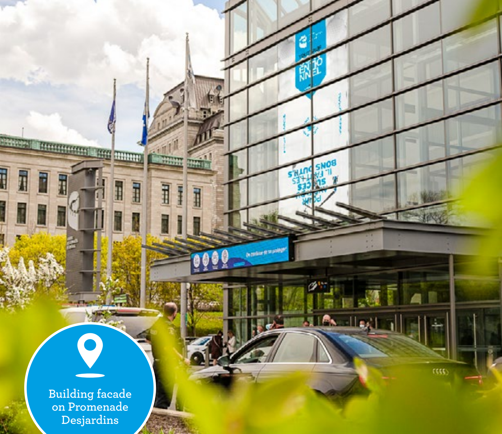
Building facade on Promenade Desjardins