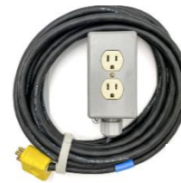
120V 15A 1 ph electrical outlet